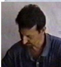
6 Medical Doctors